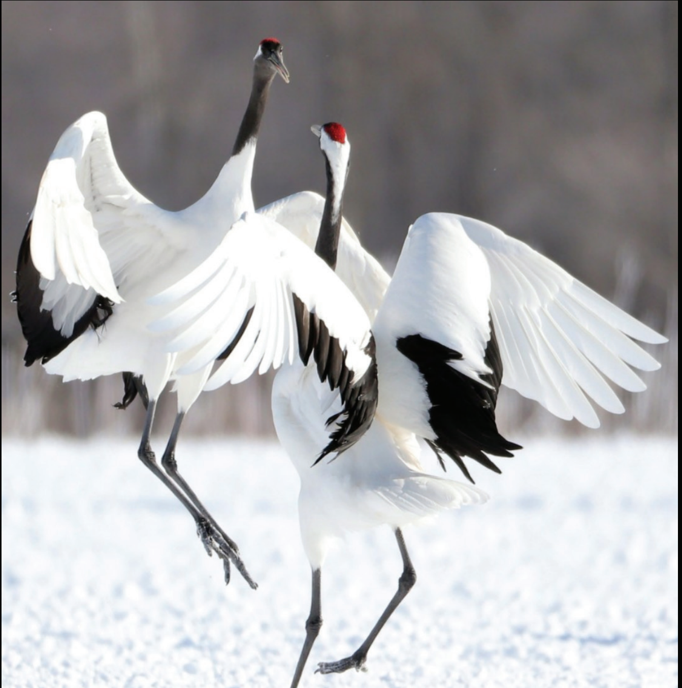
LOW WHOOPING CRANE