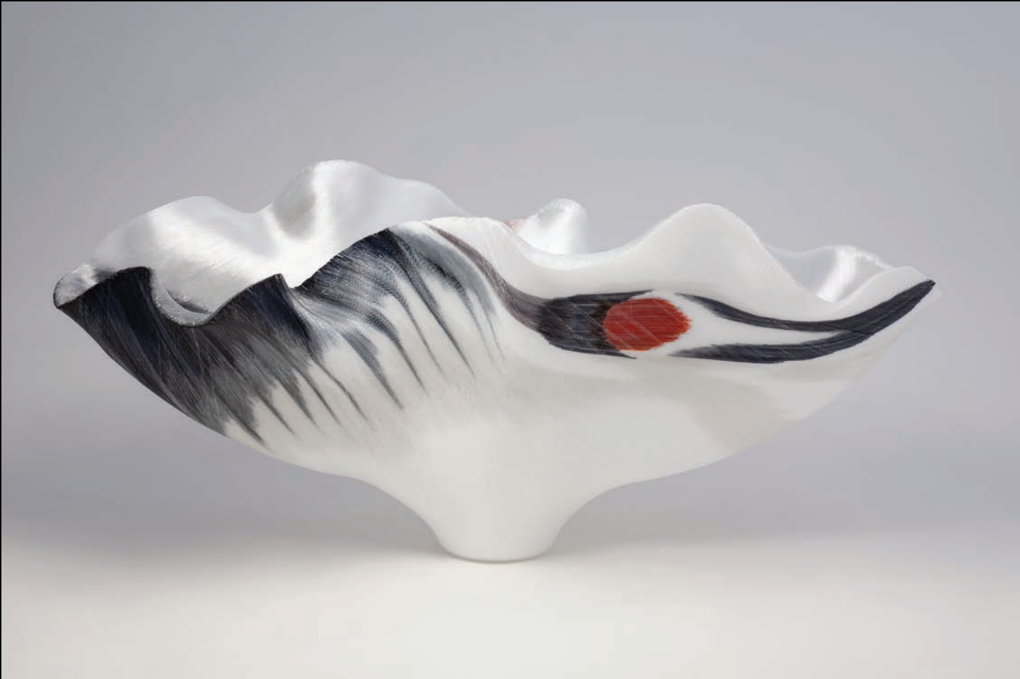
LOW WHOOPING CRANE MATE Fused and Moulded Glass Threads 13 5 / 8 x 31 7 / 8 x 13 inches