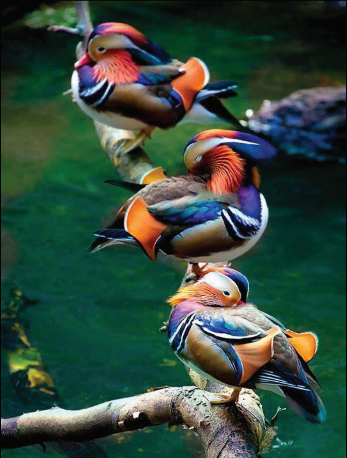
NEW MANDARIN DUCK