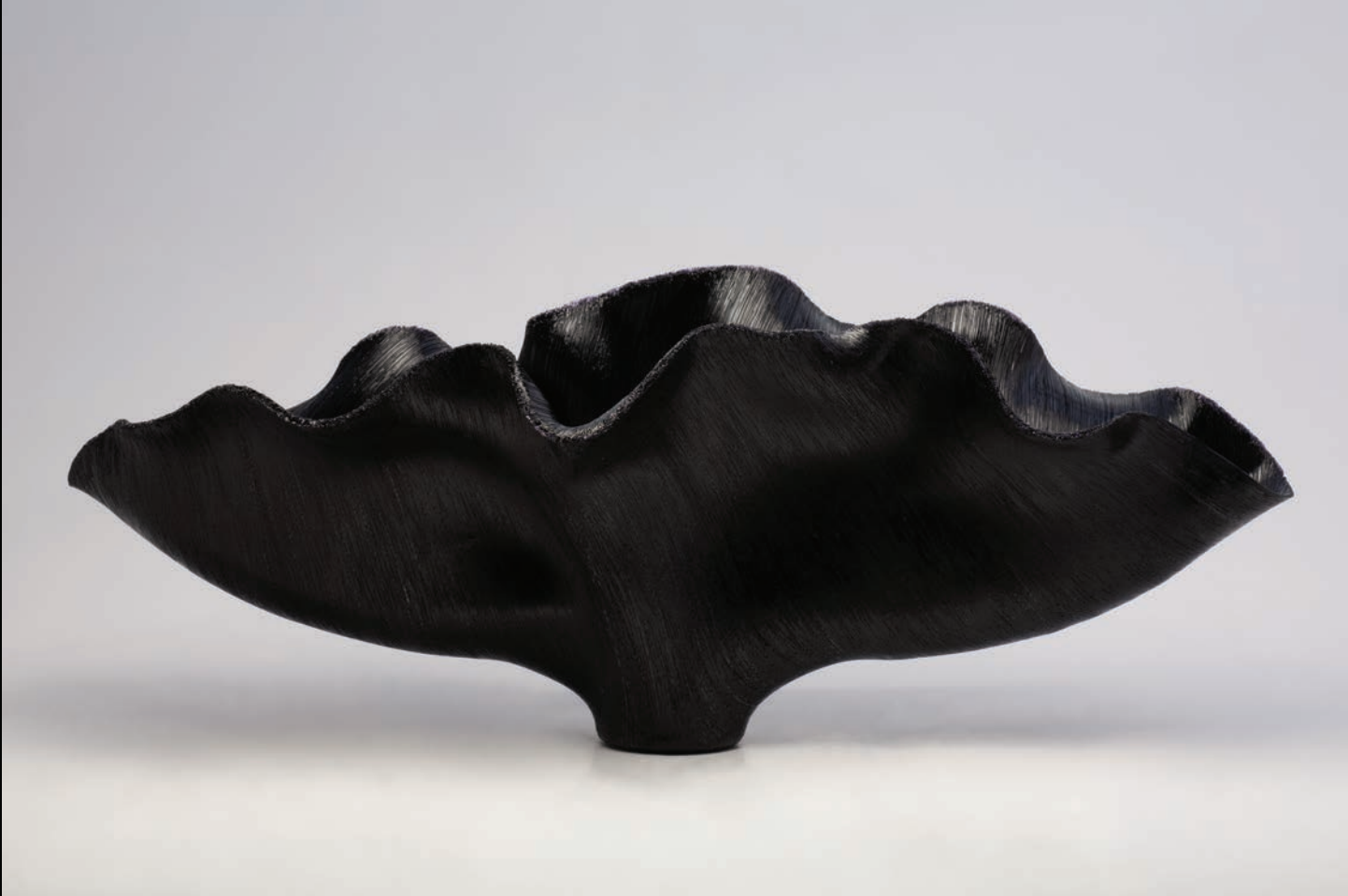
RAVEN I Fused and Moulded Glass Threads 13 x 33 x 12 inches