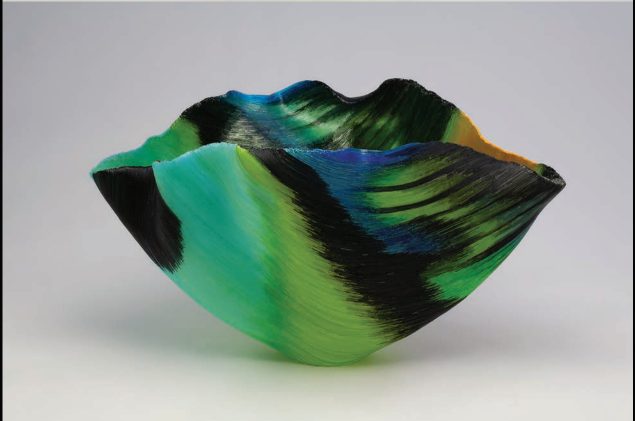
GREEN-HEADED Tanager II Fused and Moulded Glass Threads 11 x 16 1/2 x 11 3/4 inches