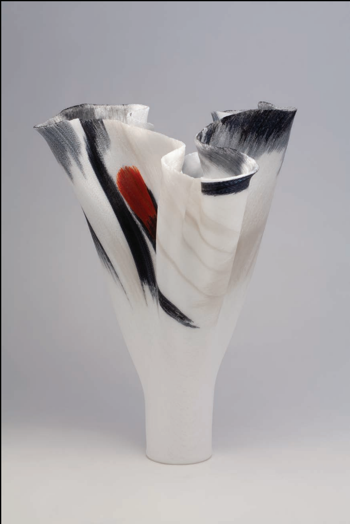
WHOOPING CRANE Fused and Moulded Glass Threads 22 3 / 4 x 16 3 / 8 x 11 inches