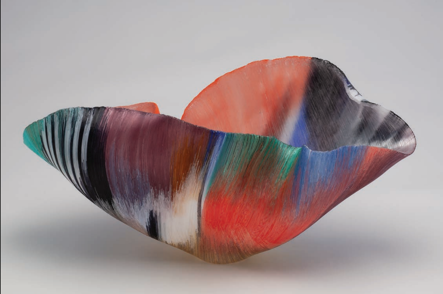
NEW MANDARIN DUCK STUDY III Fused and Moulded Glass Threads 8 1/4 x 16 1/2 x 7 1/4 inches