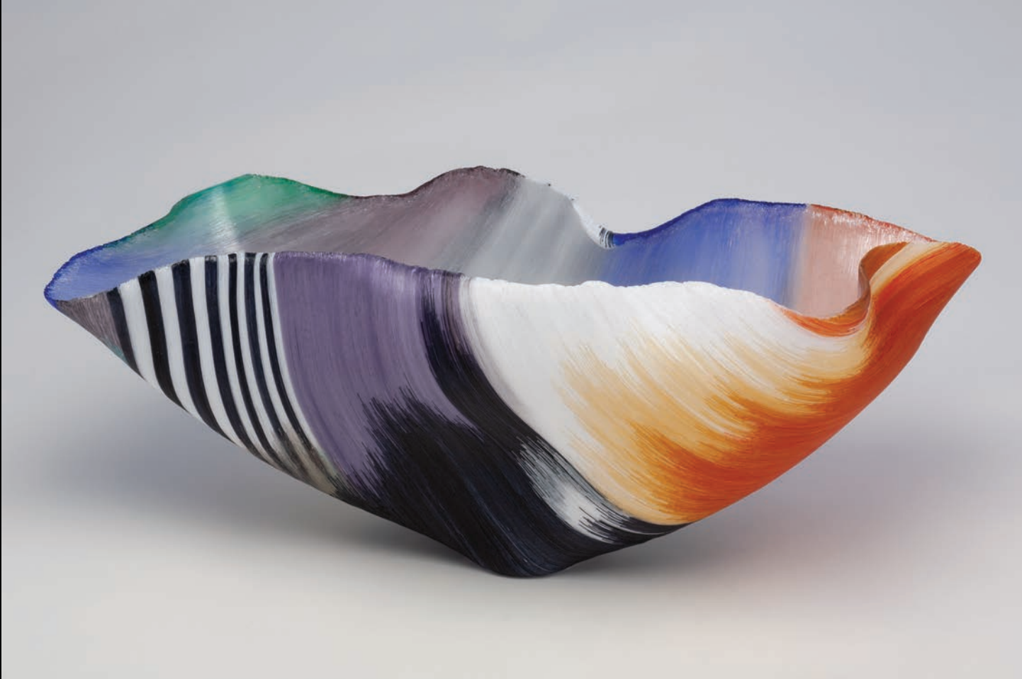
NEW MANDARIN DUCK STUDY II Fused and Moulded Glass Threads 7 1/4 x 18 x 6 3/4 inches