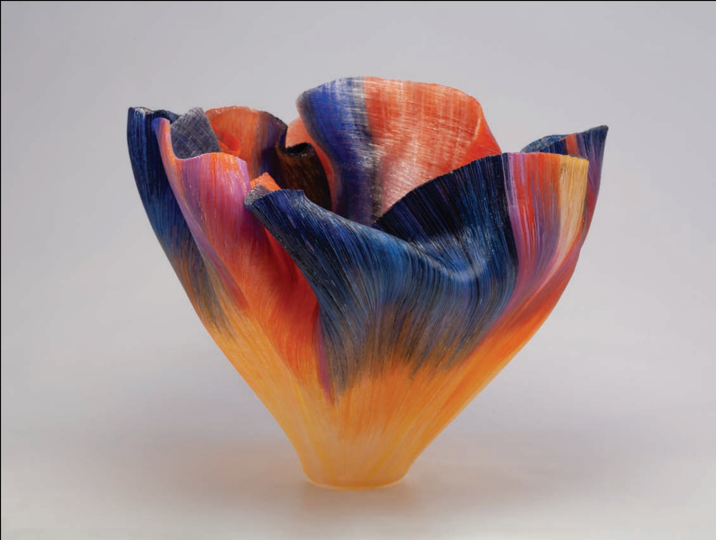
ORIENTAL DWARF KINGFISHER Fused and Moulded Glass Threads 13 3 / 8 x 17 1 / 4 x 16 inches