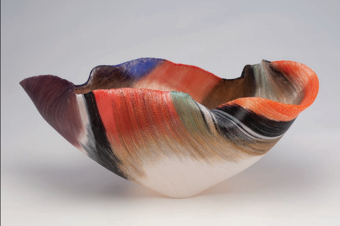
NEW MANDARIN DUCK STUDY I Fused and Moulded Glass Threads 7 x 16 x 7 7 / 8 inches