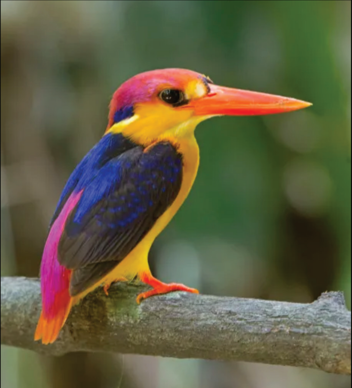
ORIENTAL DWARF KINGFISHER