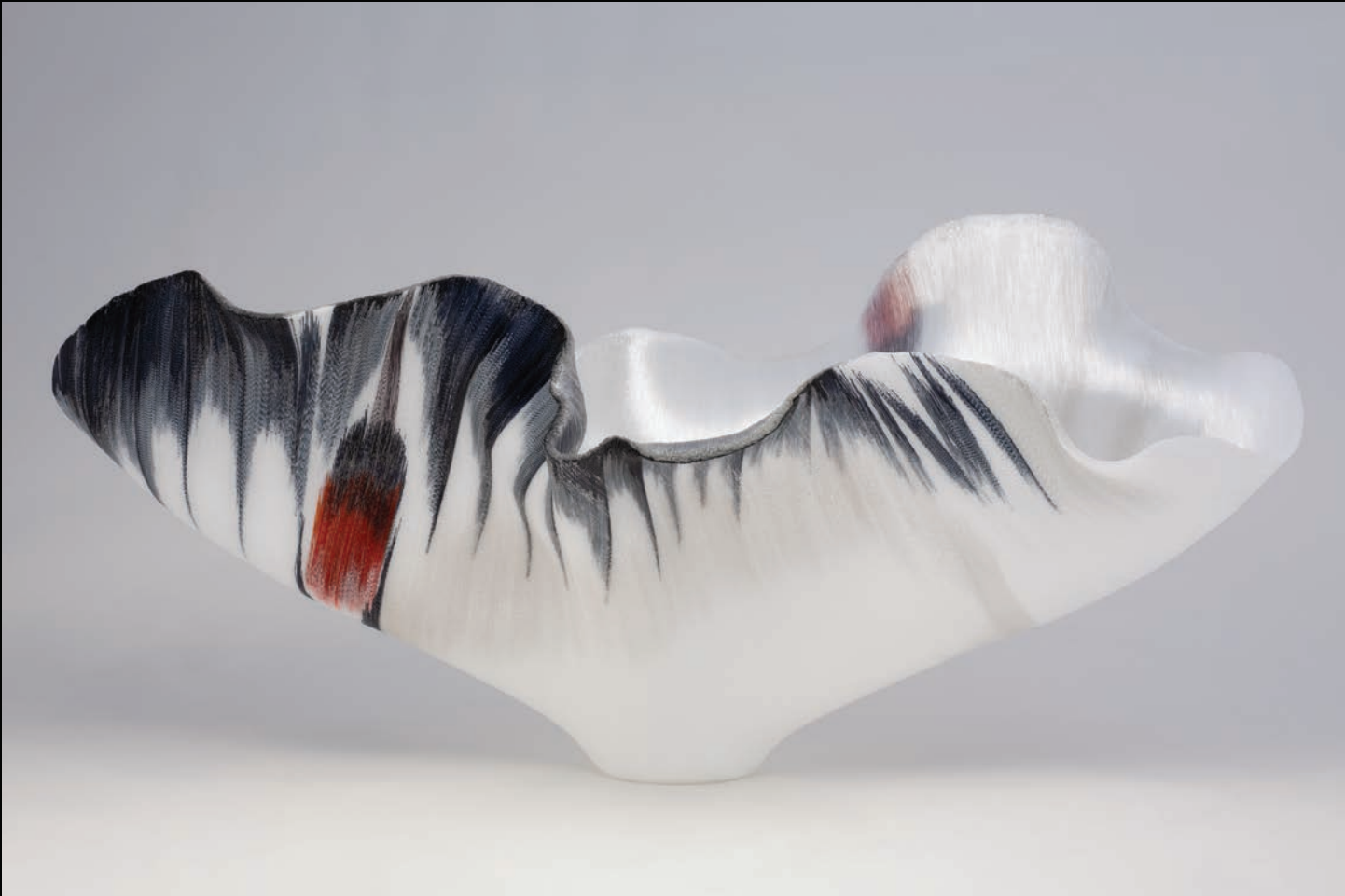
LOW WHOOPING CRANE Fused and Moulded Glass Threads 13 3 / 8 x 29 3 / 4 x 13 1 / 2 inches