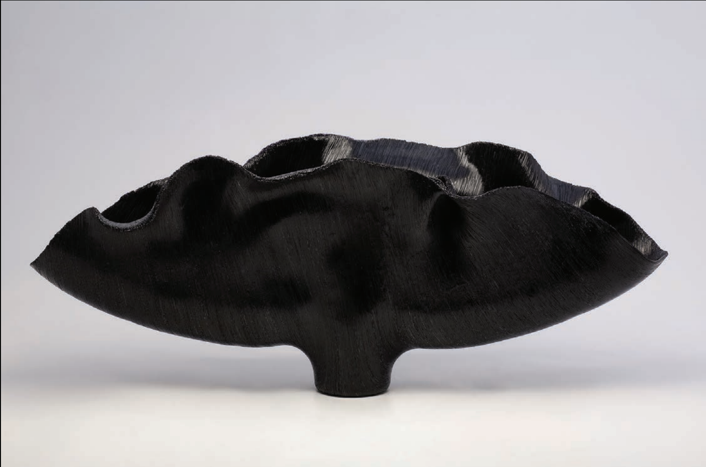
RAVEN II Fused and Moulded Glass Threads 13 3 / 8 x 33 1 / 2 x 10 inches