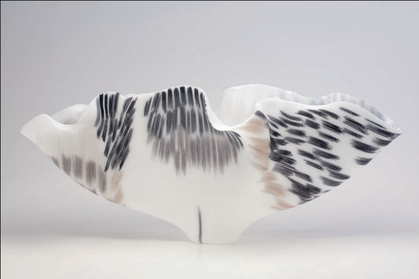
SNOWY OWL Fused and Moulded Glass Threads 13 3 / 8 x 32 1 / 8 x 13 3 / 4 inches