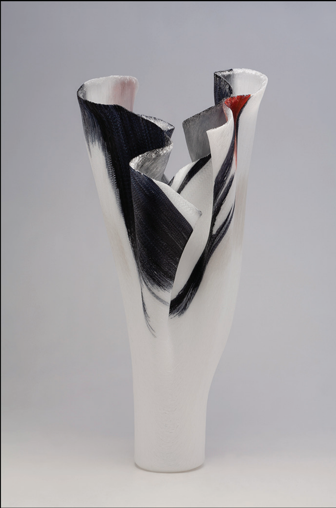
WHOOPING CRANE MATE Fused and Moulded Glass Threads 23 1/2 x 12 x 11 inches