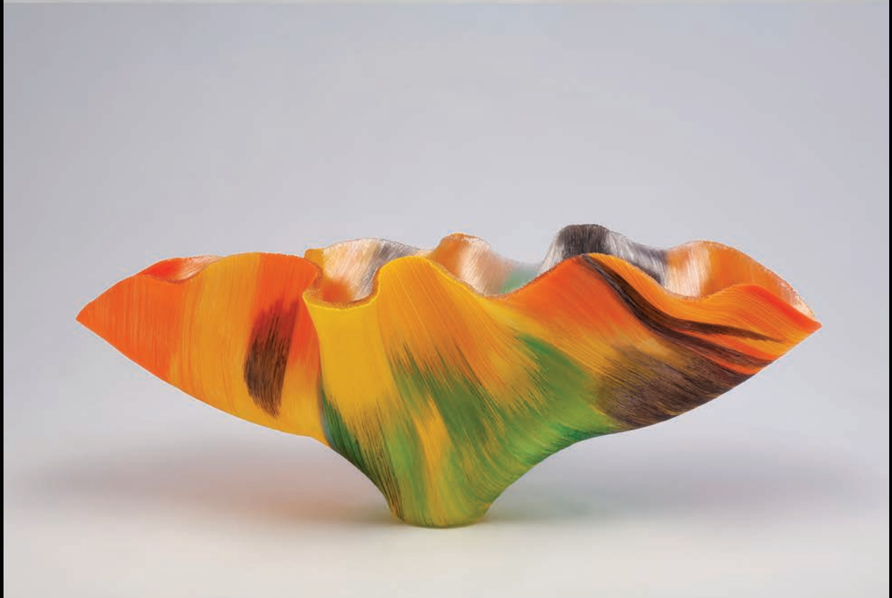
ARATINGA S. Fused and Moulded Glass Threads 9 1/2 x 24 x 9 1/2 inches