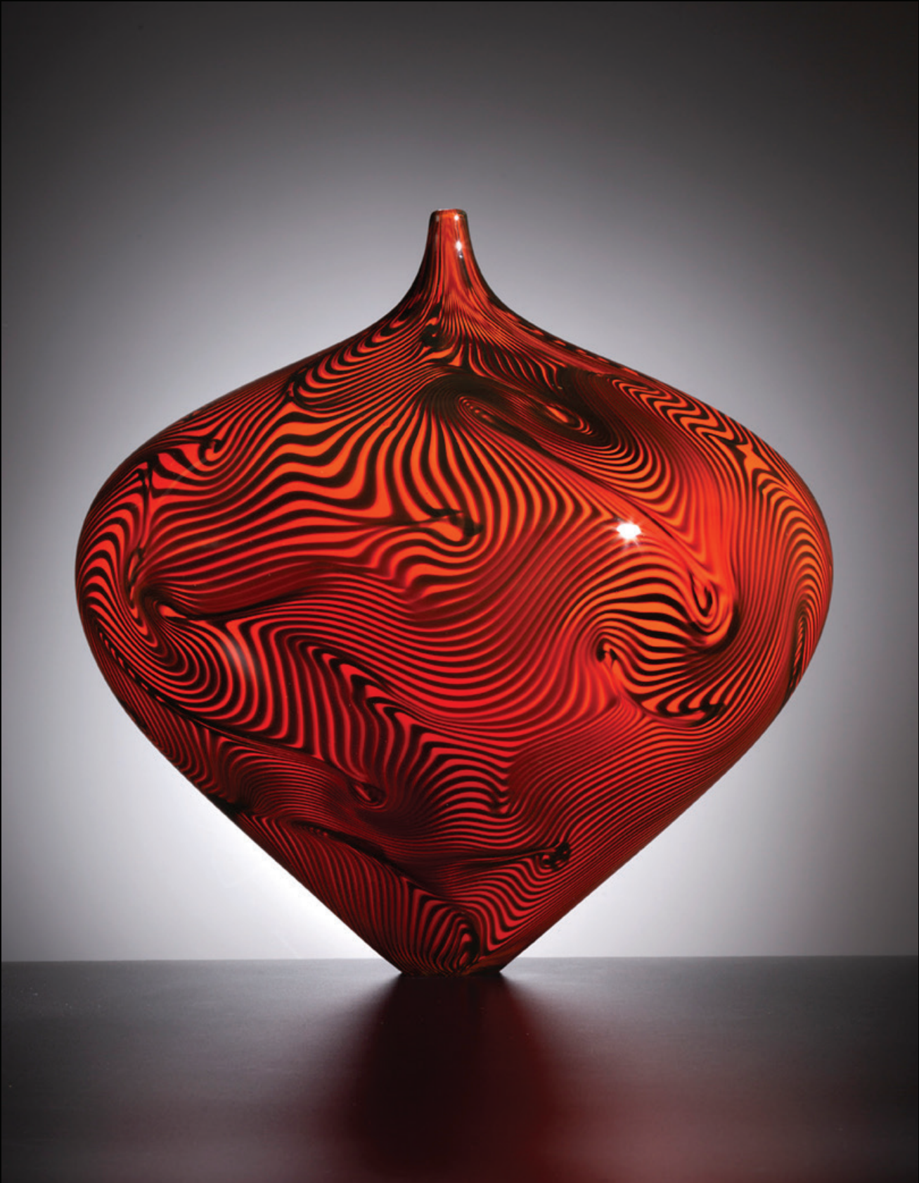
HOP 2019 15.5 x 16 x 16 inches