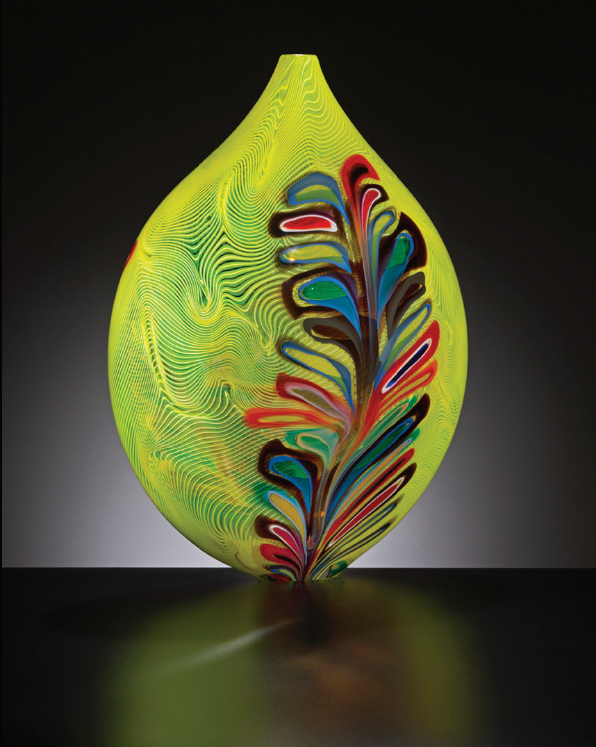
NASSAU (VIEW 2) 2020 17 x 14 x 6.25 inches