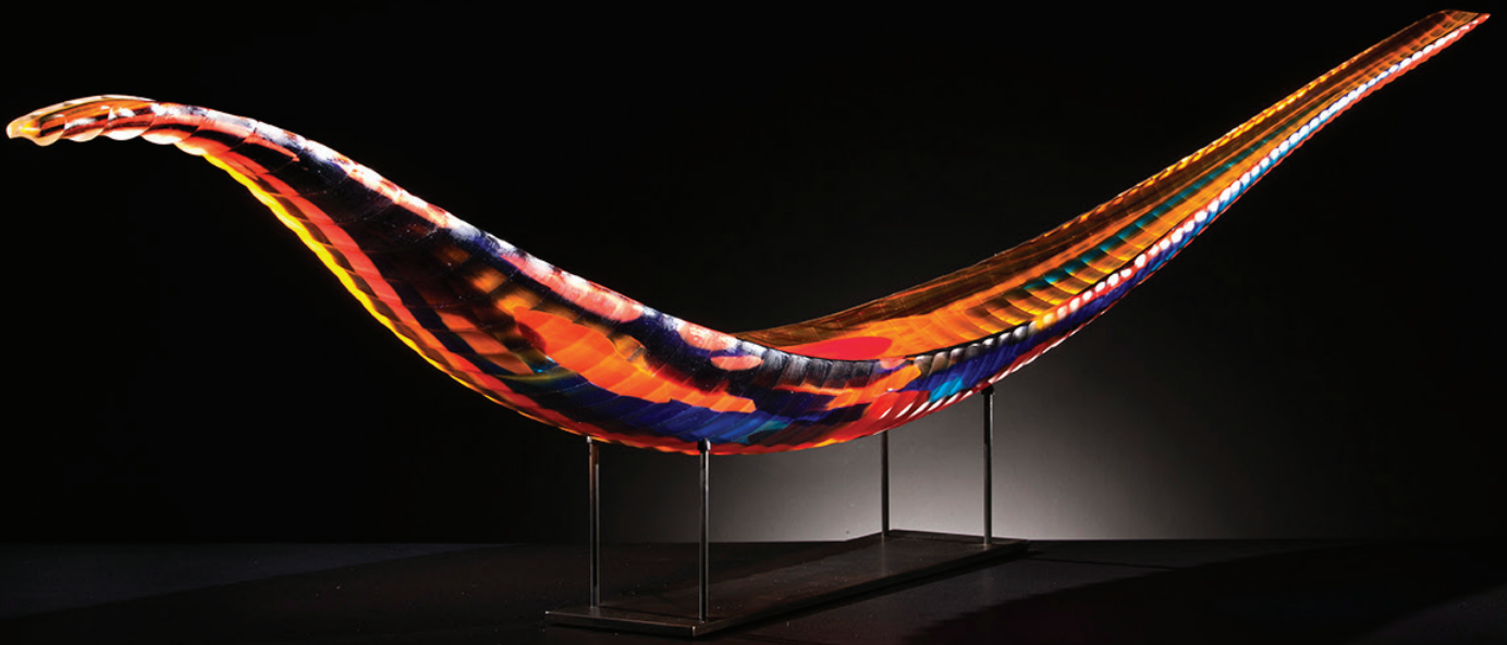
ENDEAVOR 2013 15 x 66.75 x 7.24 inches