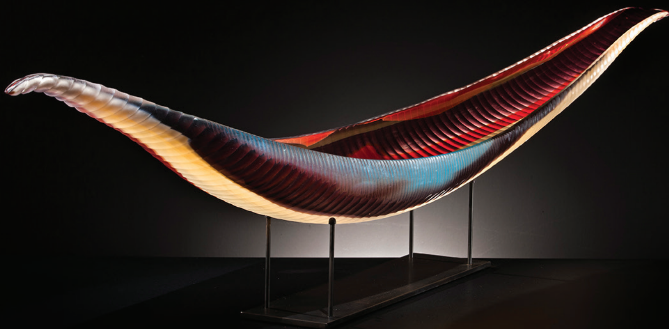
ENDEAVOR 2005 7 x 60.5 x 11 inches