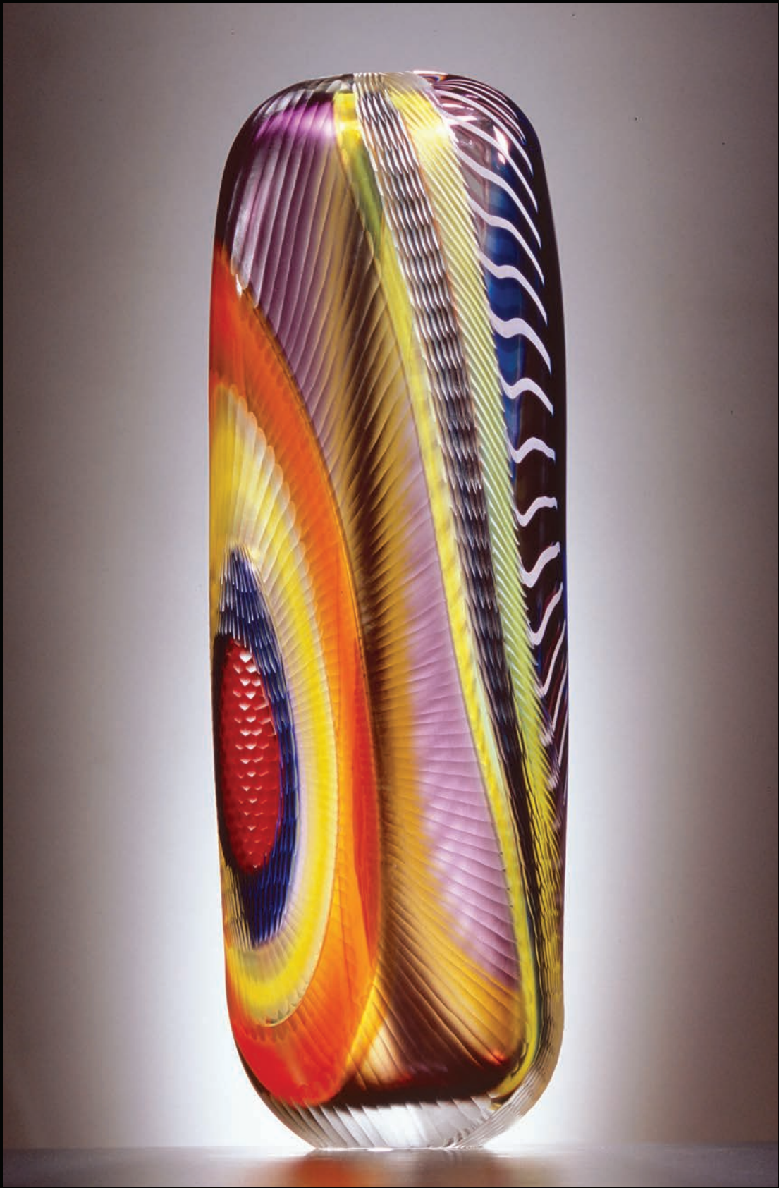
BILBAO 2005 23.5 x 8 x 4 inches