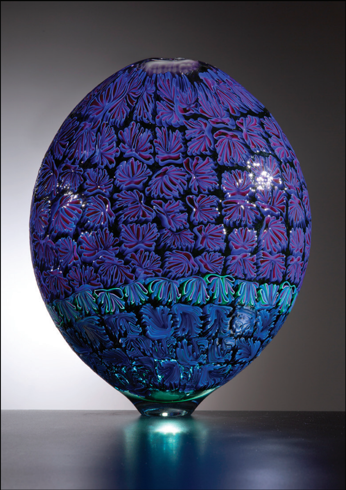
HANOI 2019 14.5 x 11.25 x 6.5 inches