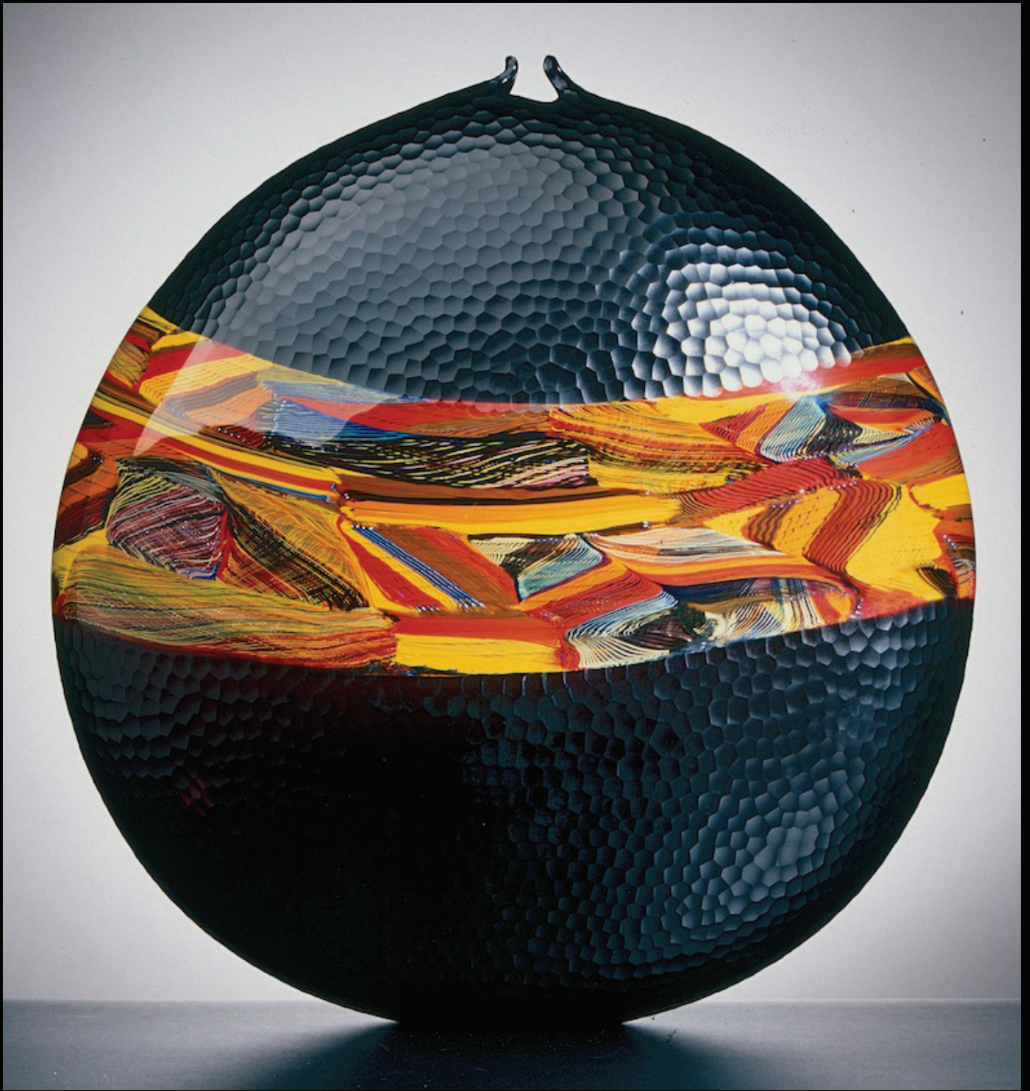
RIVERSTONE 2000 16 x 15 x 7 inches