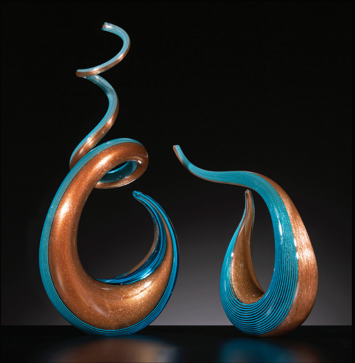
ADVENTURINE INSTALLATION (VIEW 2)