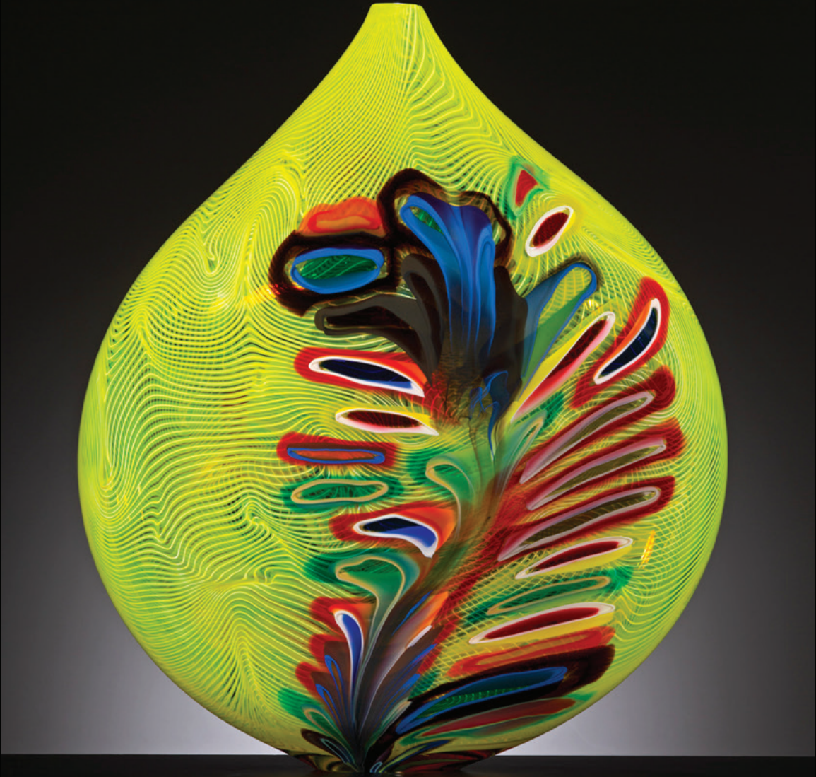
NASSAU 2020 17 x 14 x 6.25 inches