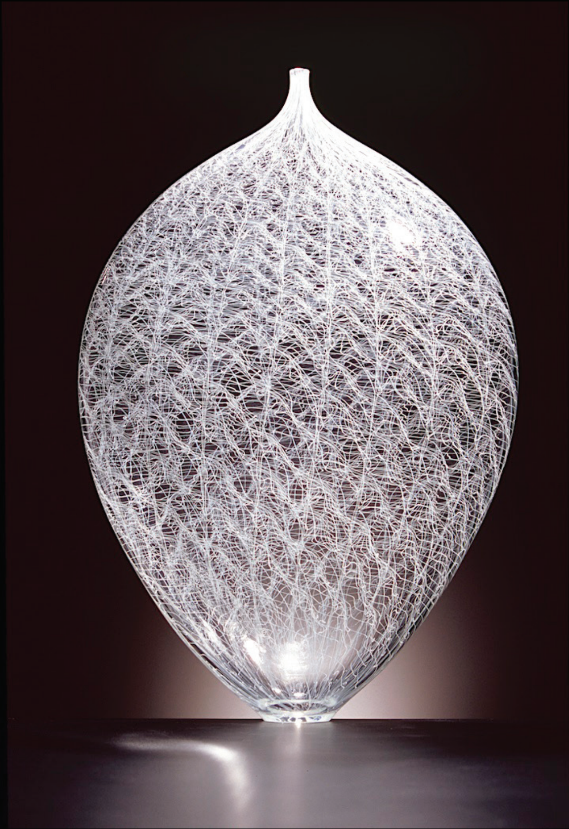
CANTU 2007 19 x 13 x 6.25 inches