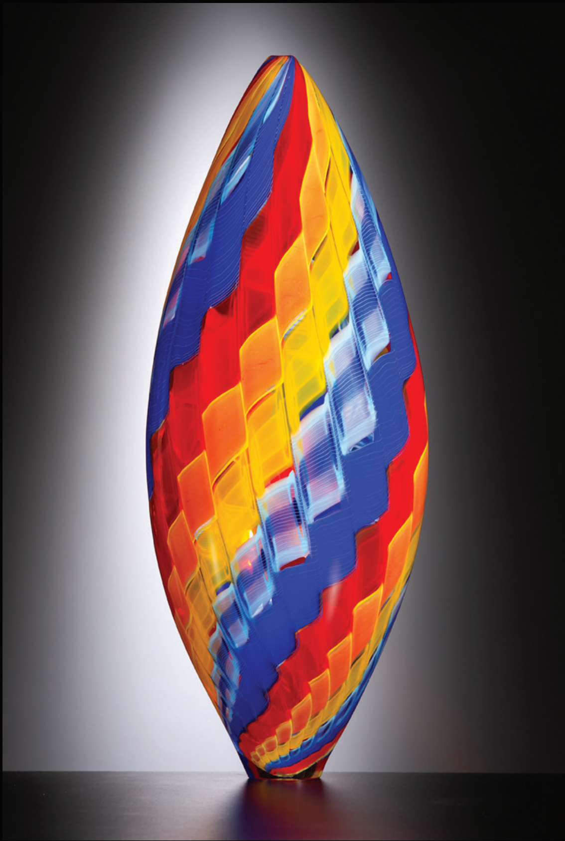
THILA 2019 17.75 x 7 x 7 inches