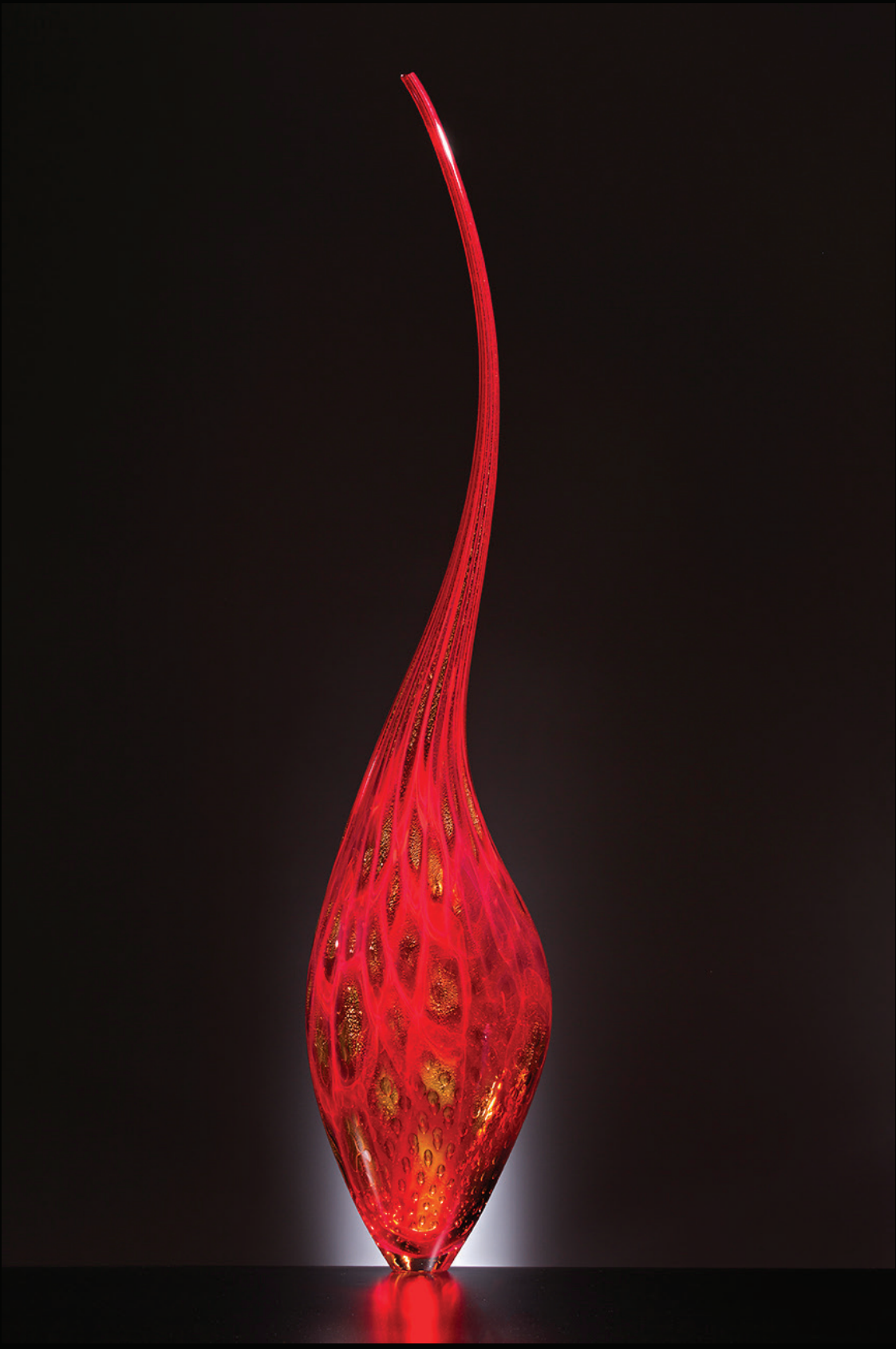
DINOSAUR 2013 54 x 11 x 7.5 inches