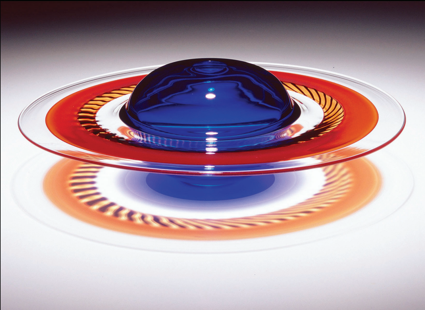
SATURNO 2008 5.25 x 17.25 x 17.25 inches