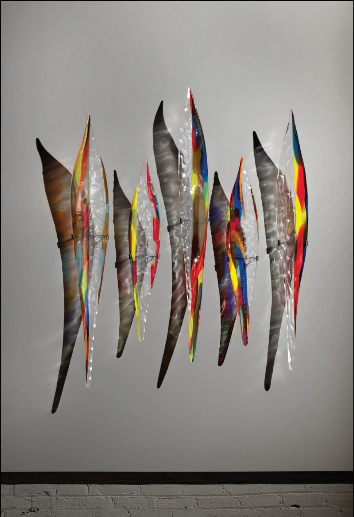
MASAI INSTALLATION 2019 54 x 48 x 8.5 inches