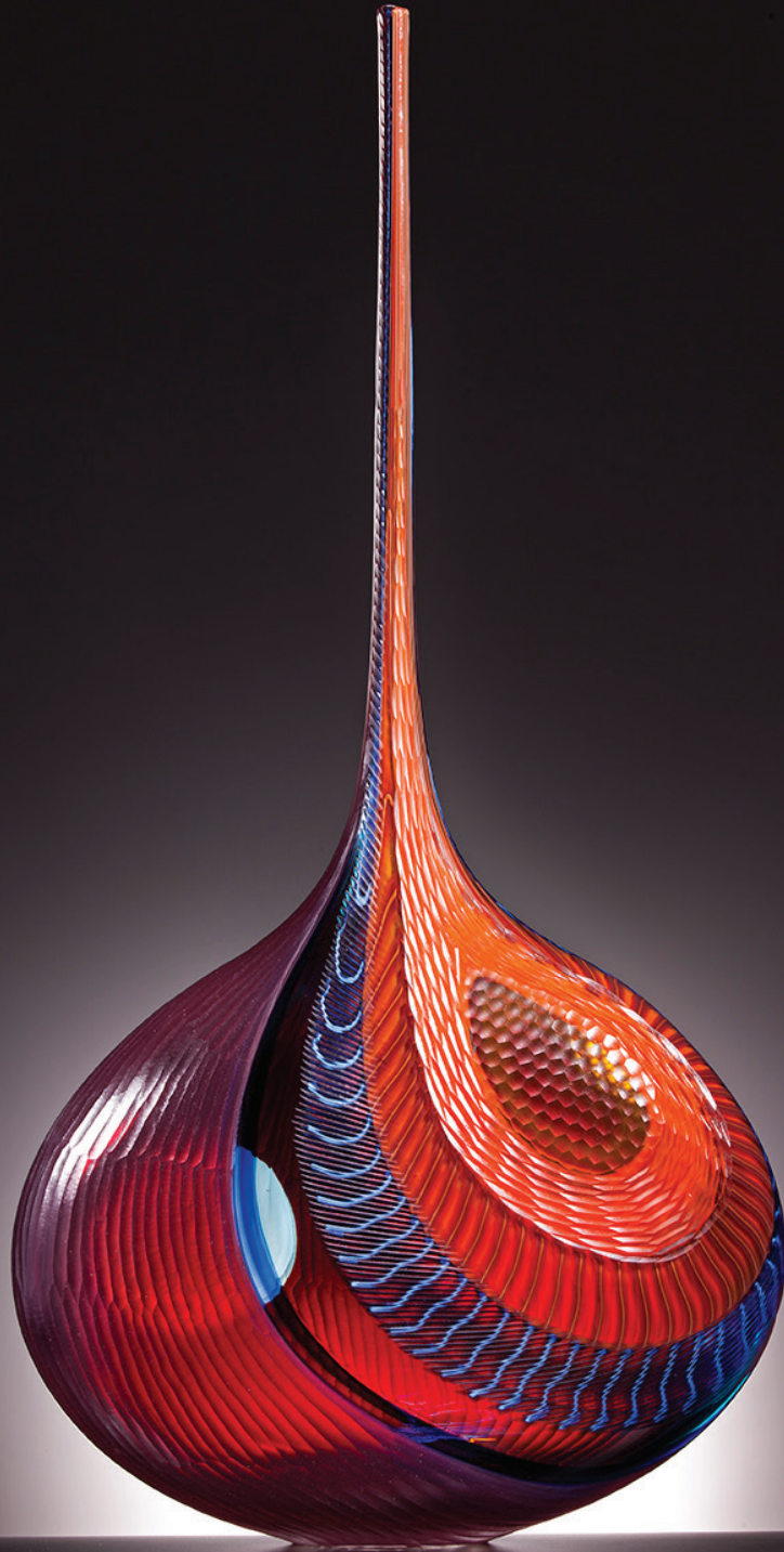
ANGEL TEAR 2005 30.75 x 15.25 x 5 inches