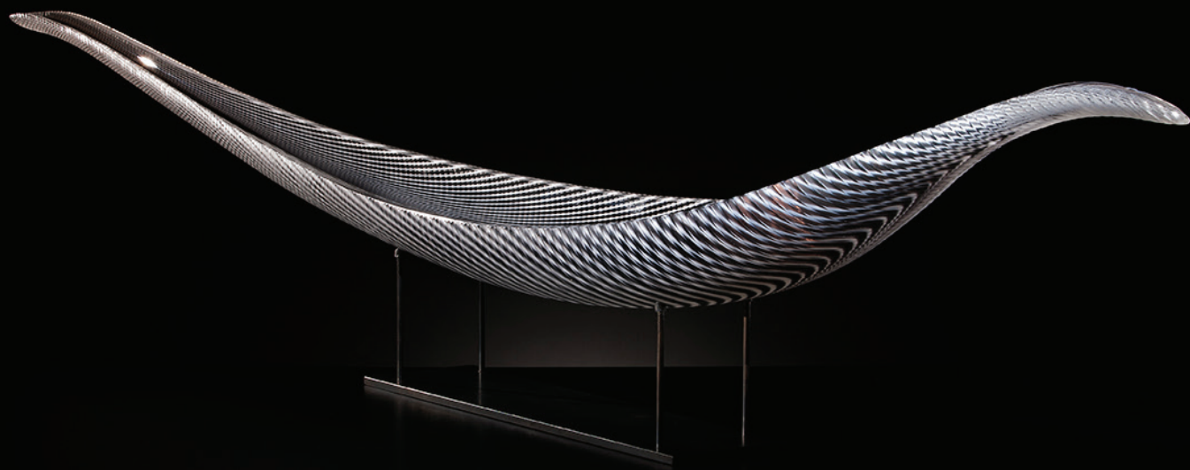
ENDEAVOR 2009 8.5 x 60.5 x 7.75 inches