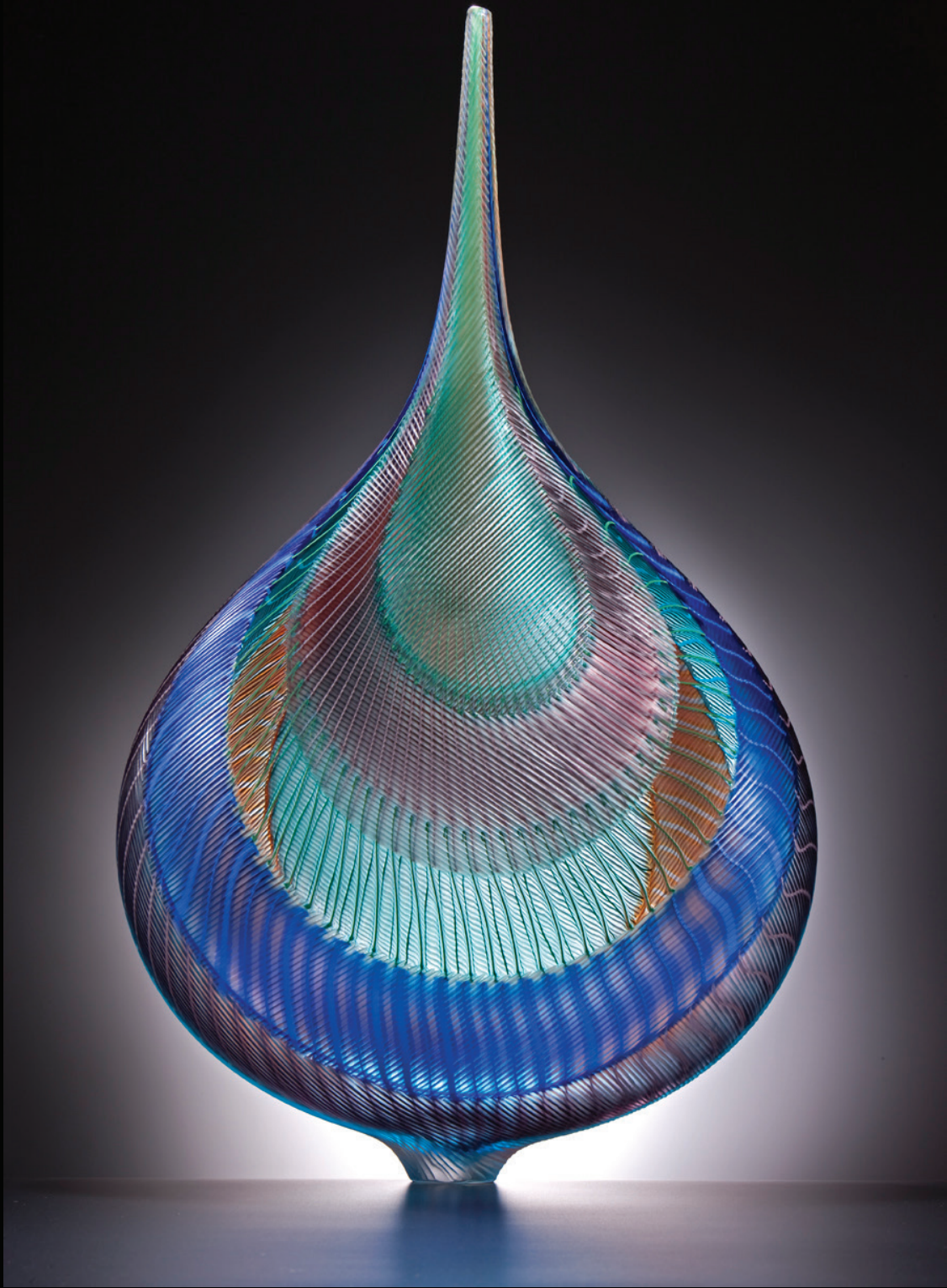
SABA 2010 31.5 x 17.5 x 6.75 inches