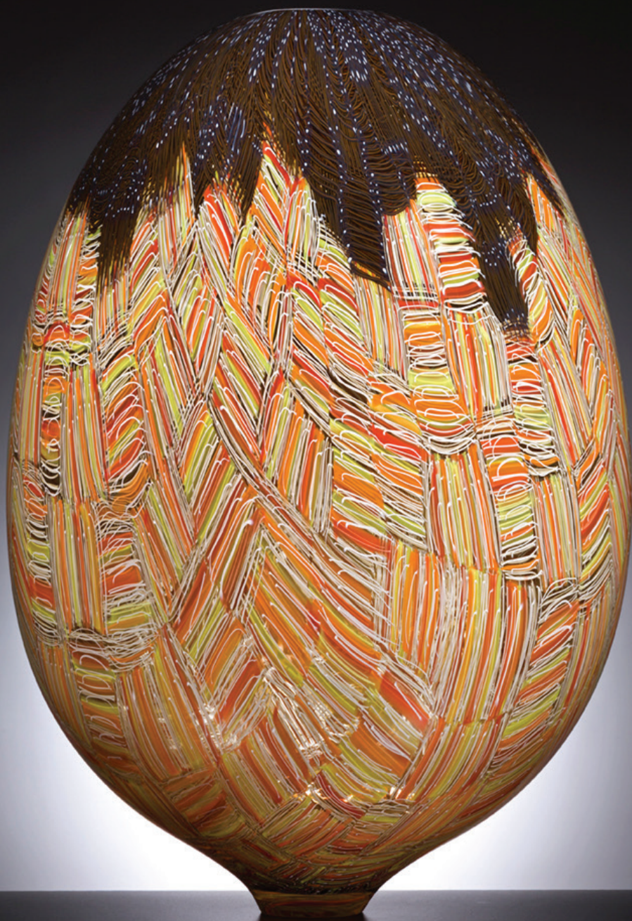
DURANGO 2016 25 x 17 x 17 inches