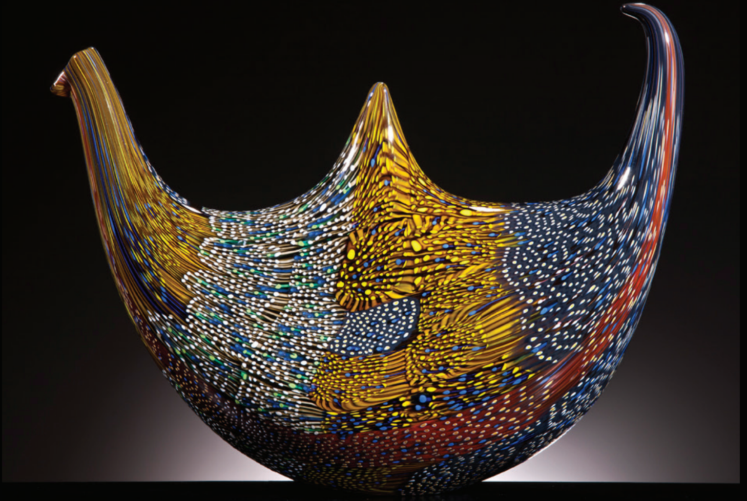
BATMAN 2012 9 x 11.5 x 3.75 inches