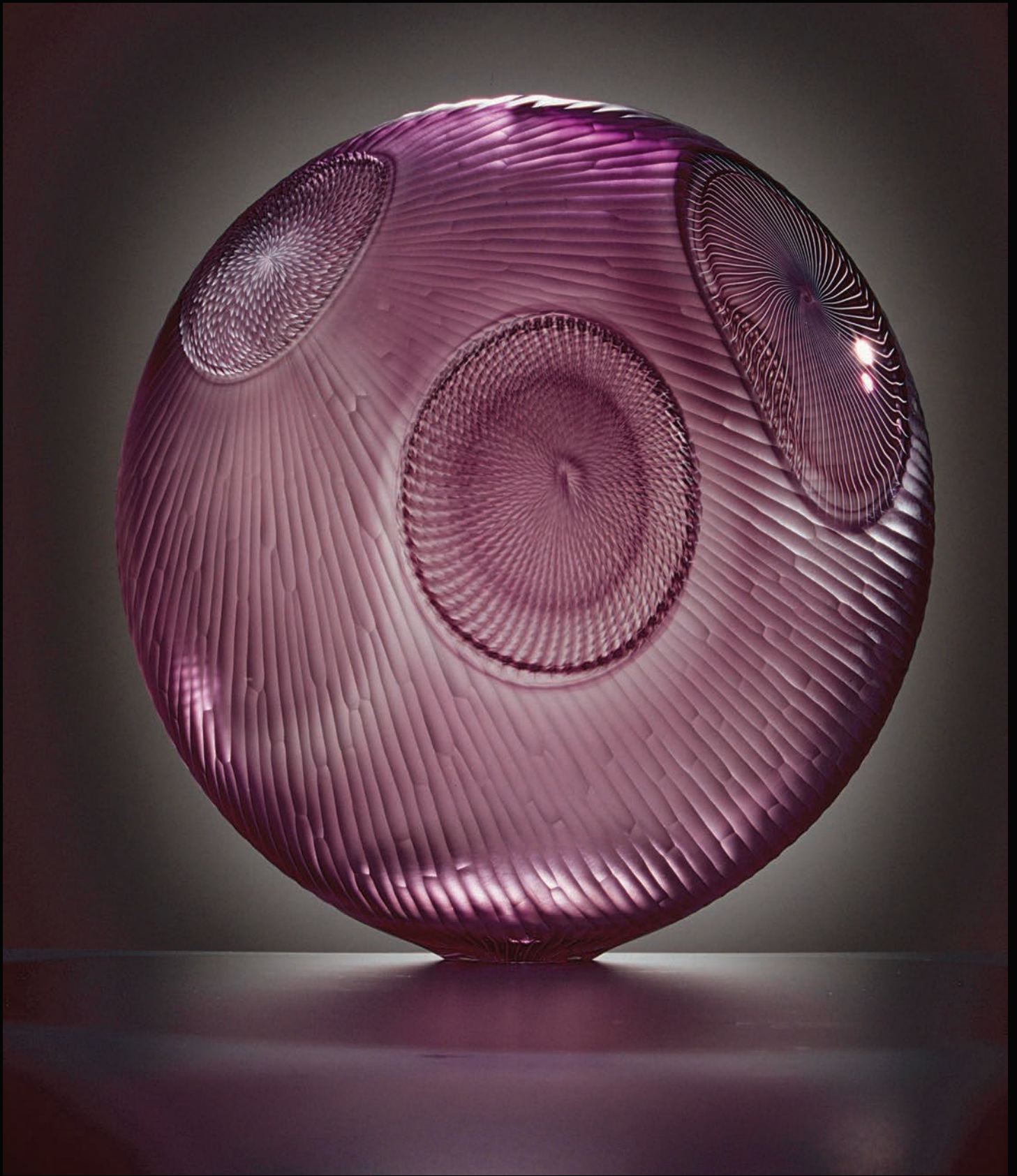
MEDUSA 2006 18.5 x 17.75 x 5.75 inches